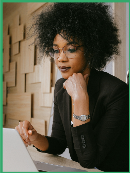
Caption: Black woman using a laptop.