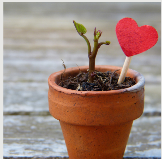
Caption: Flower pot with a plant and a heart.