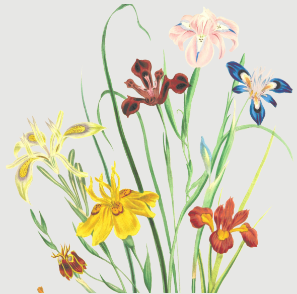
Caption: drawing of wildflowers