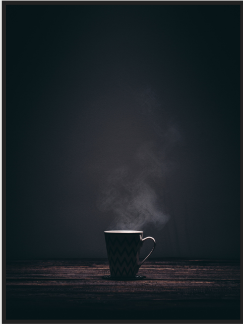
Caption: steaming cup of coffee against dark background

http://www.ala.org/ala/mgrps/rts/nmrt/oversightgroups/comm/nm/index.cfm