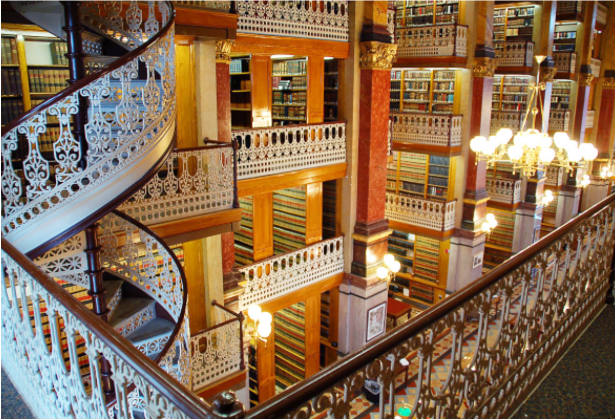
State Law Library, State Library of Iowa, Des Moines, Iowa